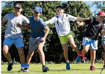
3 Legged Race