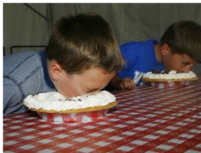
Pie Eating Contest