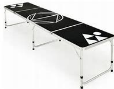
Full Size Pong