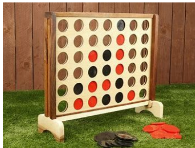
XL Connect 4